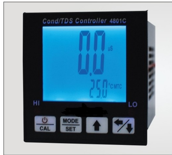
4801C Conductivity/TDS Controller