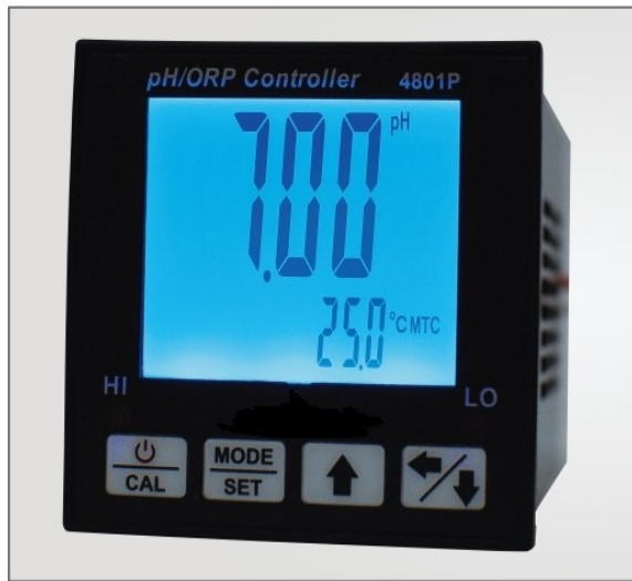
4801P pH/ORP Controller