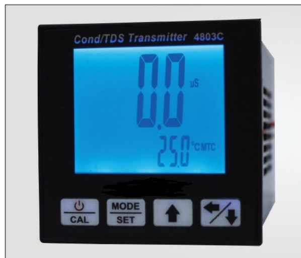
4803C Conductivity/TDS Transmitter