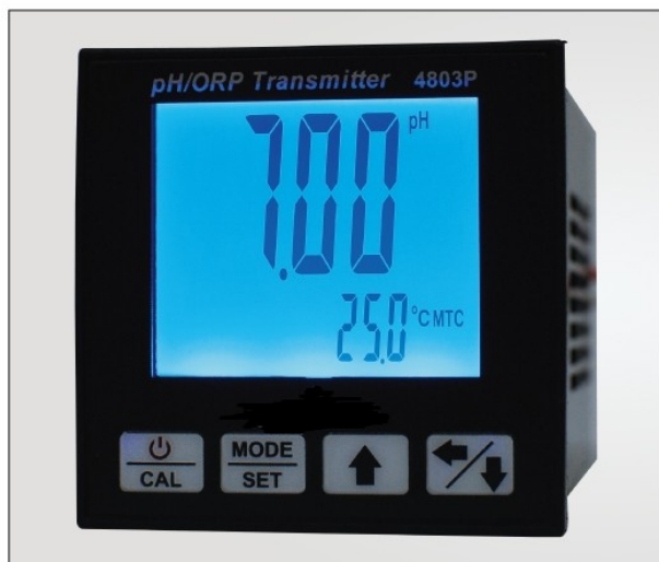
4803P pH/ORP Transmitter